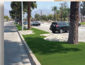
Azusa Median Project