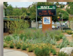
Macy Intermediate School (Monterey Park)