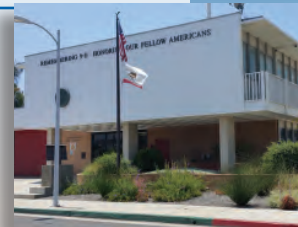
Alhambra Fire Station